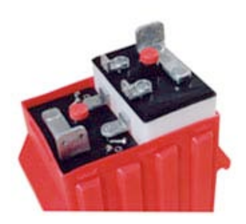
The "Dual Container" Battery is easy to disassemble

The battery is environment friendly as breakage is eliminated, thus reducing the harmful effects of sulfuric acid spills.